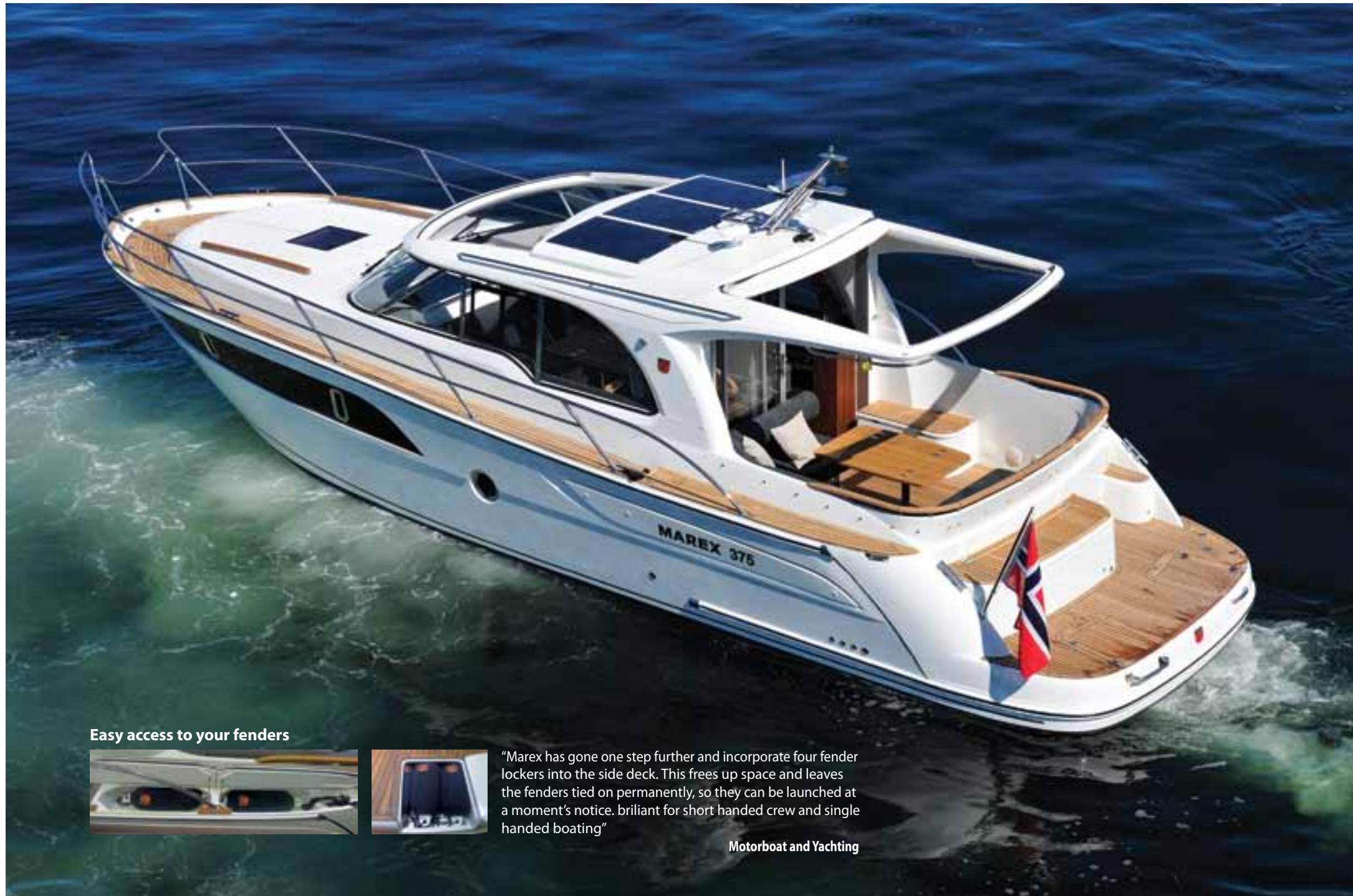
Easy access to your fenders